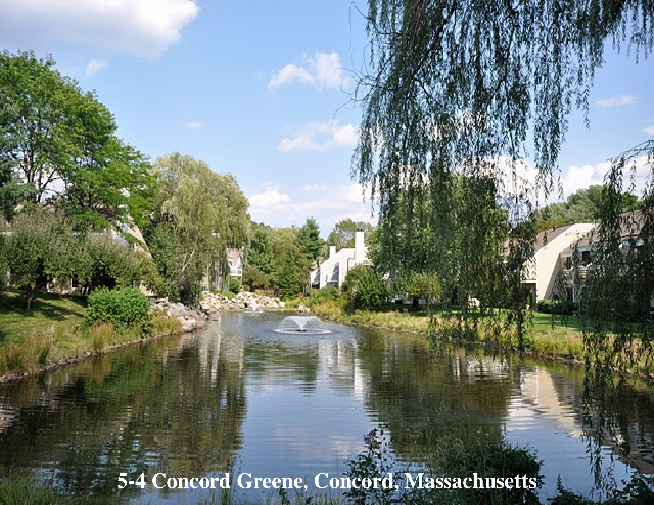
5-4 Concord Greene, Concord, Massachusetts